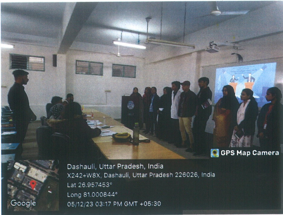
Participants during Question-Answer session