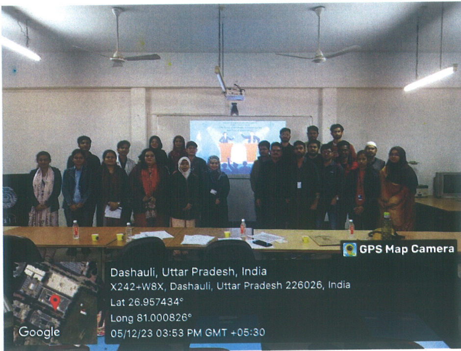
A group photograph at the end of the event.